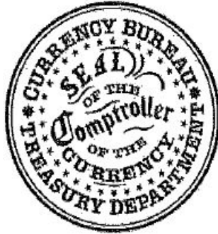
Acting Comptroller of the Currency

IN TESTIMONY WHEREOF, today, June 1, 2020, I have hereunto subscribed my name and caused my seal of office to be affixed to these presents at the U.S. Department of the Treasury, in the City of Washington, District of Columbia.